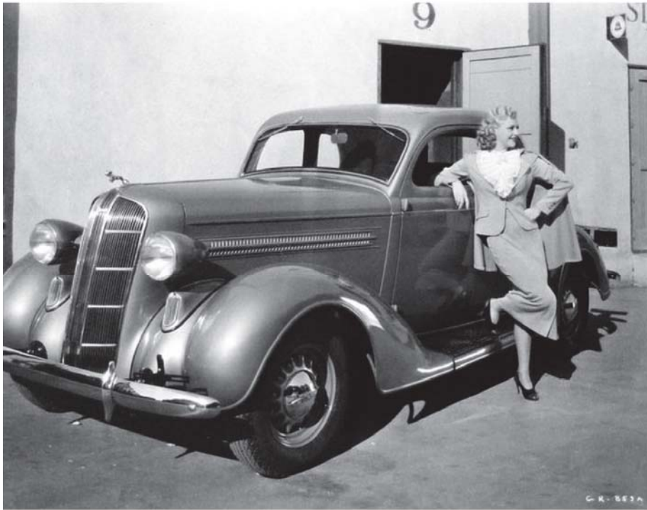
GINGER ROGERS AND HER 1937 DODGE

A Boeing 747 has a wider wingspan than the Wright brother's first flight was long.